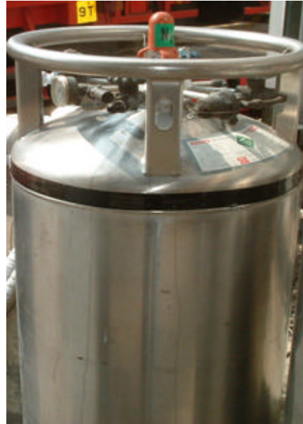
Fig.2 Liquid nitrogen (22/230/350psi)