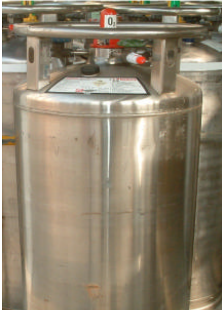
Fig.1 Liquid Oxygen (230 psi)