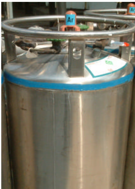
Fig. 3 Liquid Argon (350 psi)