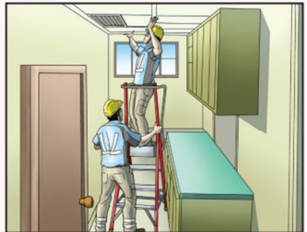
(b) Step platform 梯台