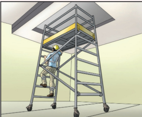
(a) Light duty working platform