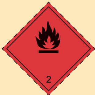
2.1 Flammable gases