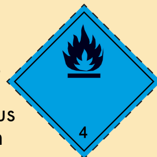
4.3 Flammable solids, self-reactive substances, solid desensitized explosives and polymerizing substances