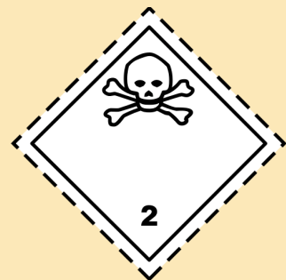
2.3 Toxic gases