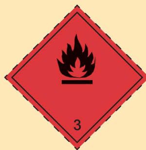
3A Diesel, fuel oil and furnace oil having a flash point exceeding 60°C (140°F) in closed cup test