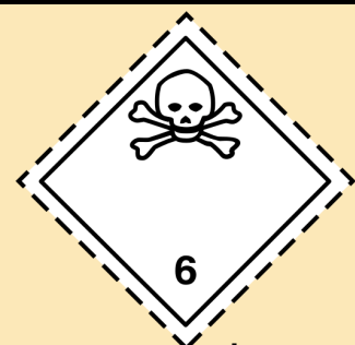
6.1 Toxic substances