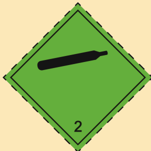
2.2 Non-flammable, non-toxic