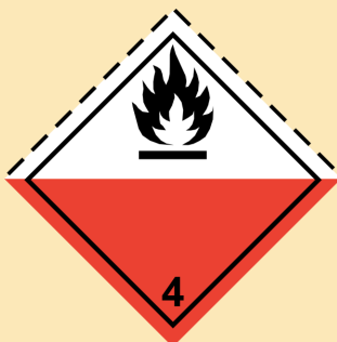
4.1 Flammable solids, self-reactive substances, solid desensitized explosives and polymerizing substances