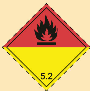
5.1 Oxidizing substances