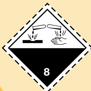
8 Corrosive substances