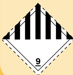
9 Miscellaneous dangerous substances & materials